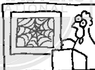
PUBLIC SPEAKING ABOUT SPIDER ABANDONMENT